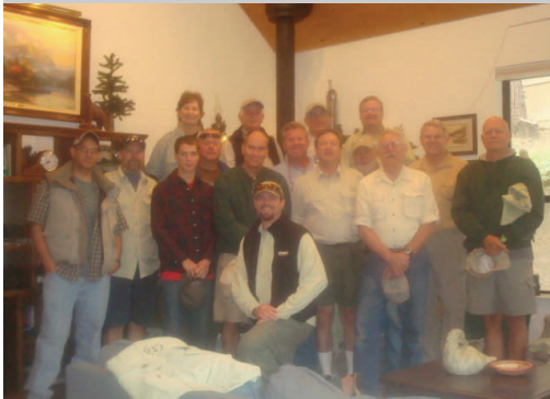
Dinky Creek Outing Crowd