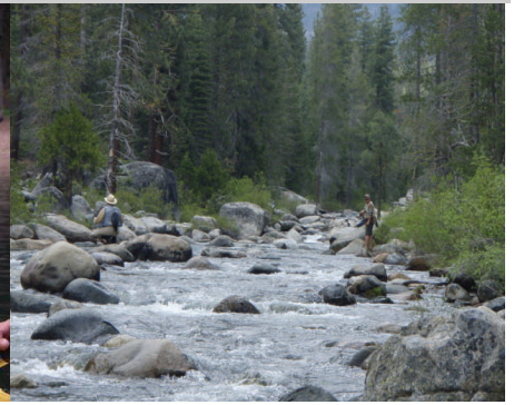
On the Creek